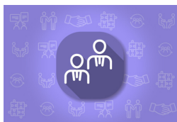
Social and Behavioral Sciences & Human Services