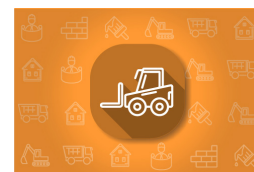
Construction, Manufacturing & Industry