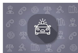
Public Safety & Law Studies